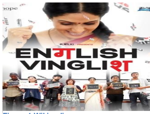
Figure 1 Wikipedia

the fields like Science, academia, and tourism, diplomacy, management consultancy and finance.